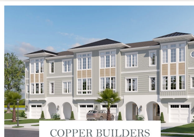
COPPER BUILDERS BUILT ON TRUST

Copper Builders are a team of industry leaders with passion and a steadfast commitment to excellence. They champion high standards throughout their company, empowering their staff with the authority to make sound decisions that bring joy to their clients.