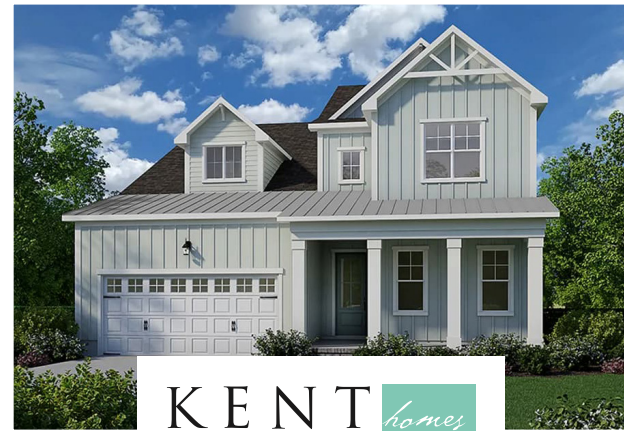
KENT homes A SMARTER WAY TO A LUXURY HOME