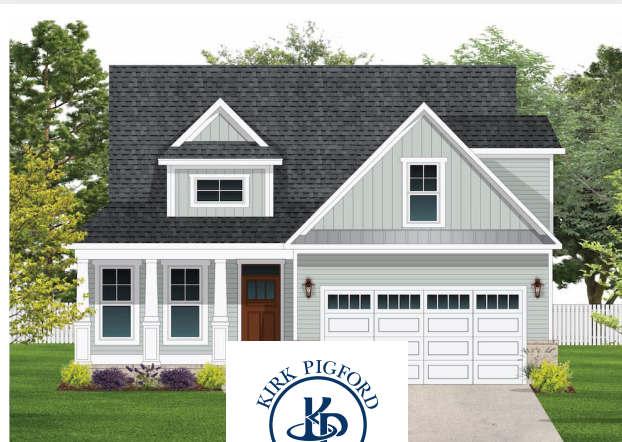
KIRK PIGFORD HOMES, LLC

Kirk Pigford Homes is family owned and operated, building in the greater Wilmington area for over 25 years. The Pigford Family has deep roots in the community, with many generations born and raised in Wilmington.